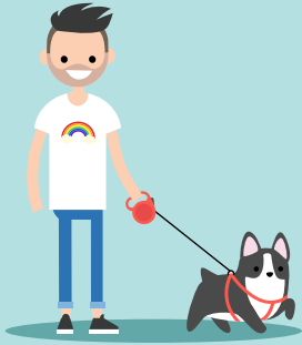
A dog on a walk