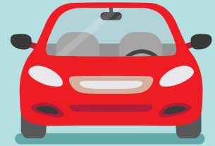
A red car