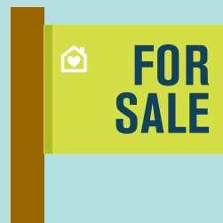
A 'for sale' sign