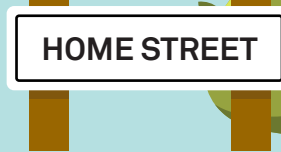
A street sign